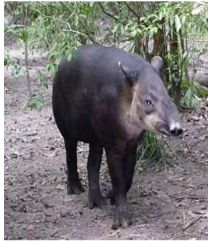
Name: Tapir Habitat: Jungle Eats. Fruits, berries, shoots and leaves Eaten by, Jaguars, crocodiles, anacondas