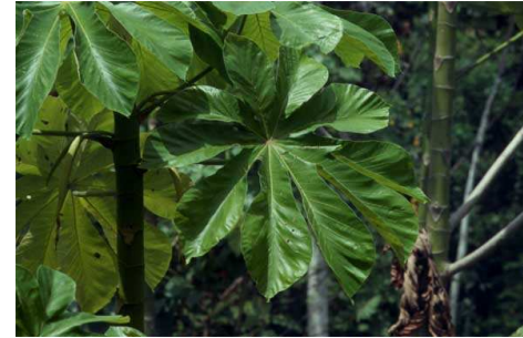
Name: Cercropia Habitat: jungle Eats: Makes food by photosynthesis Eaten by: Insects, caterpillars, tapir. Protected by vicious ants.