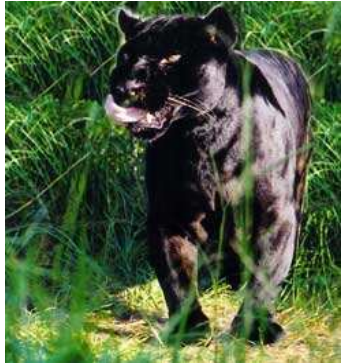
Name: Jaguar Habitat. Jungles Eats. small deer, tapir, reptiles, rodents Eaten by: Top carnivore