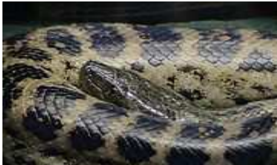
Name: Anaconda Habitat: Jungle swamps and rivers Eats: Tapir, small caimans, deer, even on occasion jaguars Eaten by: spectacled caiman