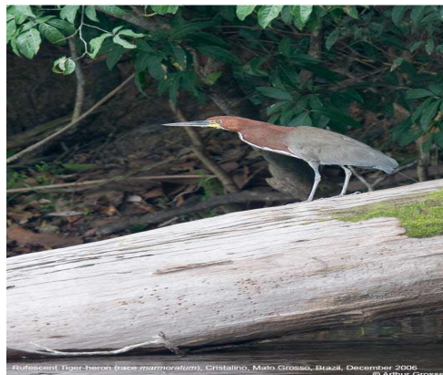
Name: Rufescent Tiger Heron Habitat: Jungle swamps and rivers Eats : Fish, reptiles and amphibians Eaten by. Anaconda, caiman.